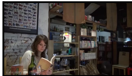
課程標題 | Can I take your order please? 請問我可以幫您點餐了嗎?(BEG)