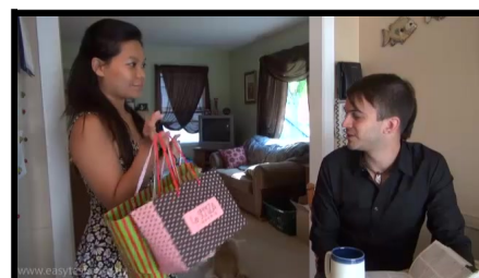
課程標題 Buy-one-get-one-free. 買一送一。(BEG)