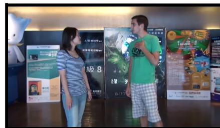
課程標題 What did you think of the movie? 你覺得這部電影怎樣?(BEG)