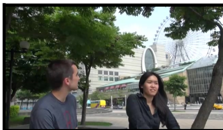
課程標題 Dollar Theaters. 二輪戲院。(ADV)